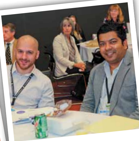
Networking is central to the Meet & Greet Program.