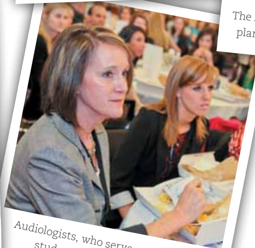
Audiologists, who serve as mentors to students, develop mentoring relationships across the country.