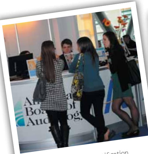
Interest in ABA certification was off the charts this year.

The number of board certified audiologists has grown to 1,407, with 44 having achieved specialty certification in pediatrics and 40 in cochlear implants. ABA's presence at AudiologyNOW! grew this year also. The new ABA Lounge was a popular location for certified audiologists to meet, collaborate, work, and charge electronics. The annual ABA Meet & Greet drew a record number of 252 students, who were paired with 92 audiologists in a mentoring relationship. An incredible 74 hours of Tier One programming was offered for certified and noncertified audiologists alike, providing the highest level of continuing education. This year's AudiologyNOW! allowed the ABA to truly showcase the reasons it has become the most highly respected certifying body in audiology. 🎧