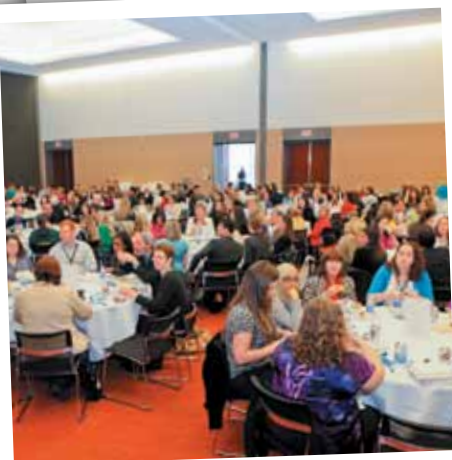
Students and audiologists attend the ABA Meet & Greet.