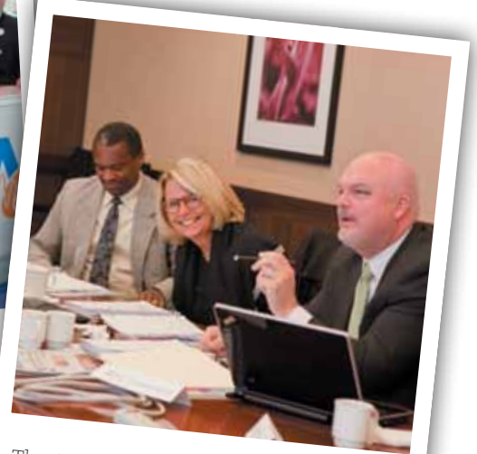
The ABA Board of Governors, hard at work planning the future of ABA certification.