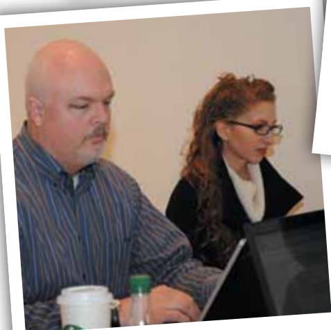
The ABA and the Student Academy of Audiology collaborate on supporting student education.