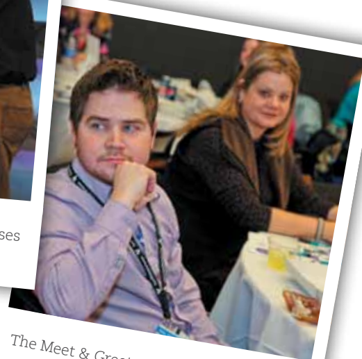
The Meet & Greet attendance was double last year's attendance.