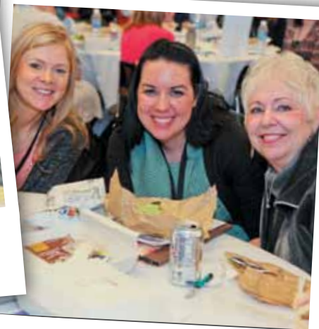
A few of the 252 students and 92 mentors at the Meet & Greet.