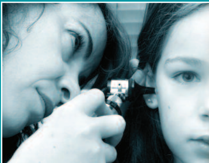
Board Certified in Audiology®

ABA Board Certification in Audiology, and specialty certification in pediatric audiology or cochlear implants, are high marks of distinction in the profession. Certificants have the education and experience needed to pass a rigorous exam that earns them the right to display their ABA credentials to patients, colleagues, peers, and the community.