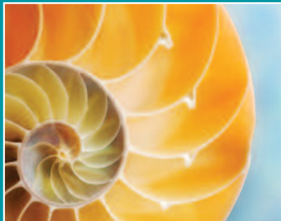
Cochlear Implant Specialty Certification®