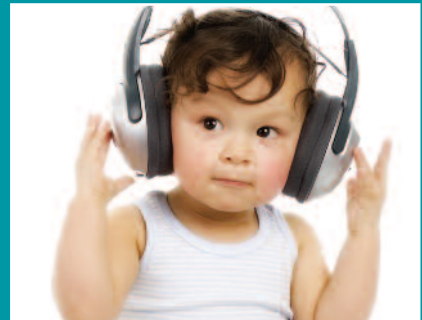
Pediatric Audiology Specialty Certification®

To learn more and download applications, visit www.boardofaudiology.org .