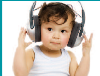
Pediatric Audiology Specialty Certification®

To learn more and download applications, visit www.boardofaudiology.org .