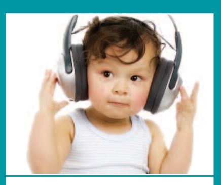
Pediatric Audiology Specialty Certification®

To learn more and download applications, visit www.boardofaudiology.org .